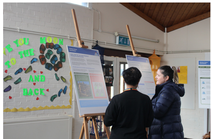
Drop in information session