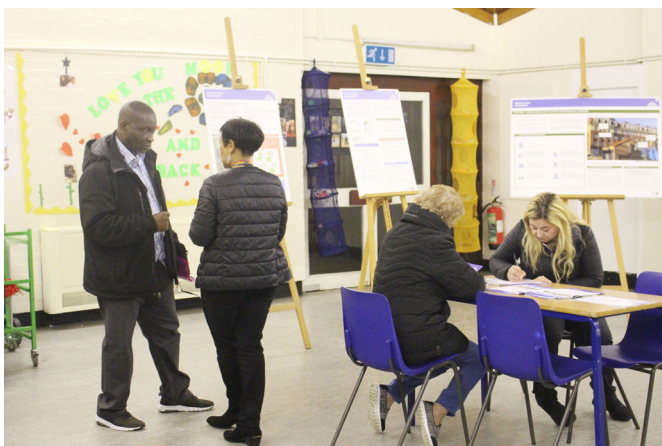
Drop in information session

This newsletter provides an update about the final outcomes of the survey and the next steps of the City Corporation.